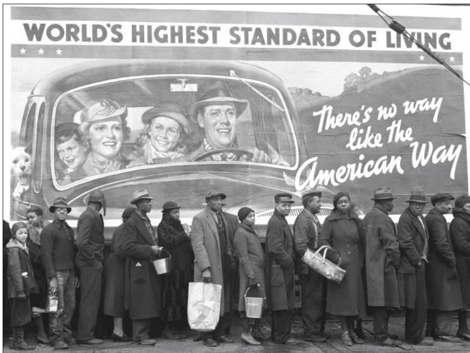
Lining up for food in Louisville KY during the Great Depression, 1937

The Great Depression in the United States lasted from 1929 to 1941, and only ended because of the U.S. entry into World War II in December 1941. No decade in the 20th century was more terrifying for people throughout the world than the 1930s, which included economic disorder, the rise of totalitarianism, and the coming (or existence) of war. For Americans, the 1930s summons up such images as breadlines, rural poverty, and homeless families in shacks cobbled together from salvaged wood, cardboard, and tin. The combination of severe drought and plummeting agriculture prices during the decade caused the Dust Bowl disaster, the worst drought in modern U.S. history, which in 1934 covered more than 75 percent of the country and severely affected 27 states. As a result, some 2½ million Americans fled the Plains states, and many headed for California where the promise of a better life often collided with the reality of scarce, poorly paid work as migrant farm laborers. Illinois experienced its own natural disaster during the