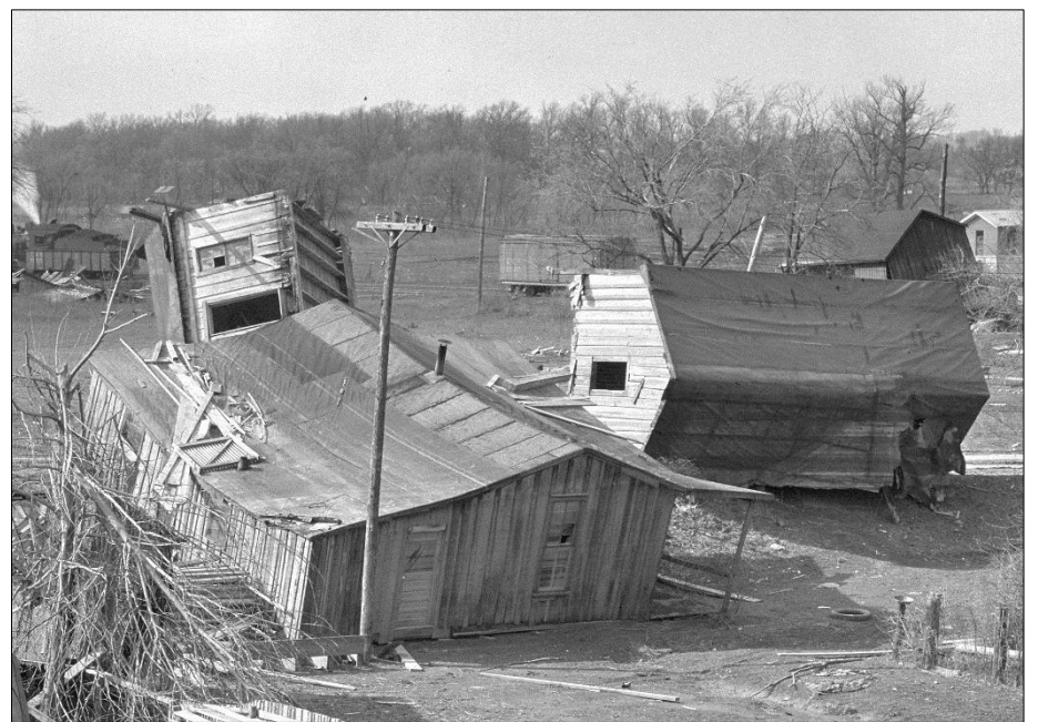
Overturned houses in Shawneetown IL resulting from 1937 flooding

The Great Depression changed the American family structure in dramatic ways. Many couples delayed marriage — the divorce rate dropped sharply (it was too expensive to pay the legal fees and support two households), and birth rates dropped below the replacement level for the first time in American history. Traditional roles within the family changed during the 1930s — men finding themselves out of work now had to rely on their wives and children to make ends meet. Many did not take this loss of breadwinner status very well, and a 1940 survey revealed that 1½ million married women had been abandoned by their husbands. It was a time when thousands of teenagers became drifters, feeling they were a burden to their families; and children grew up quickly, taking on adult responsibilities. Long considered the "last hired, first fired" before the Great Depression, minorities were the first sector of the population impacted by job layoffs. African American men were either shut out completely, or had to settle for separate and lower pay scales, and a shortage of jobs in the Southwest led to the illegal deportation of 400,000 Mexican-Americans.