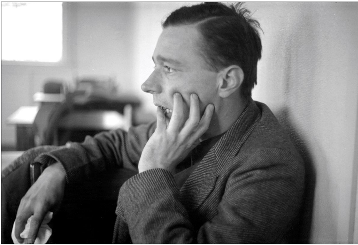
Walker Evans 1937

Walker Evans (1903-1975) was one of the most influential artists of the twentieth century. His elegant, crystal-clear photographs and articulate publications have inspired several generations of artists. The progenitor of the documentary tradition in American photography, for fifty years from the late