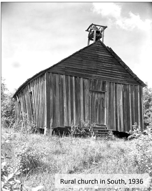
Rural church in South, 1936

In June 1935, he accepted a job from the U.S. Department of the Interior to photograph a government-built resettlement community of unemployed coal miners in West Virginia. This turned into a full-time position as