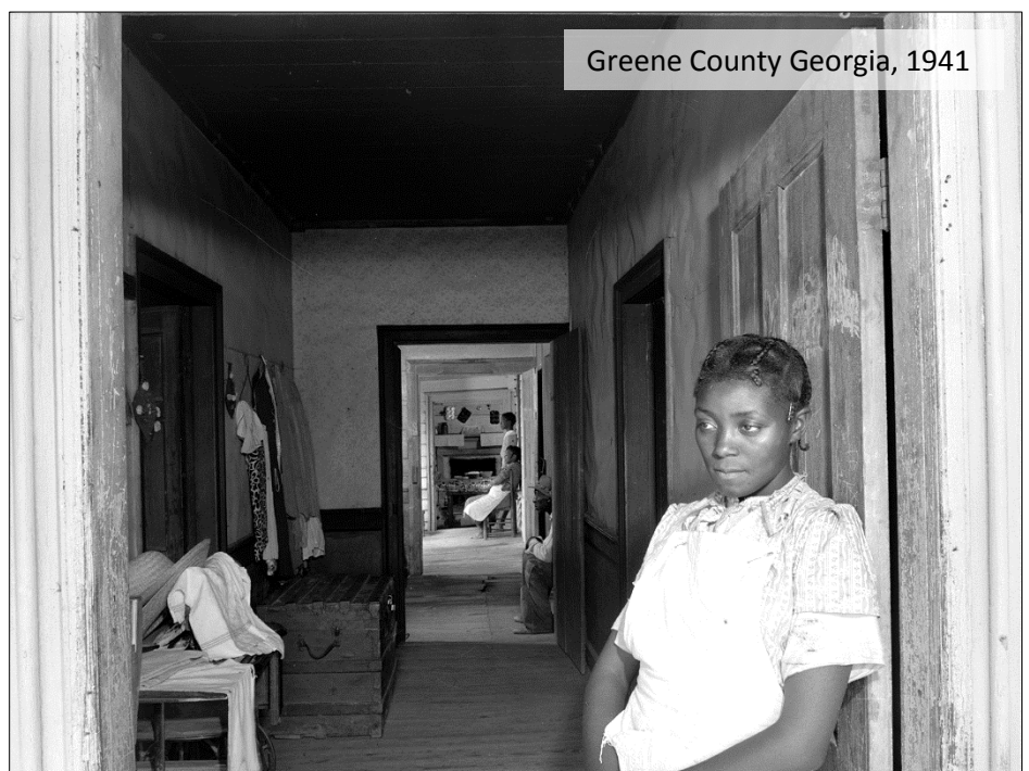
Greene County Georgia, 1941